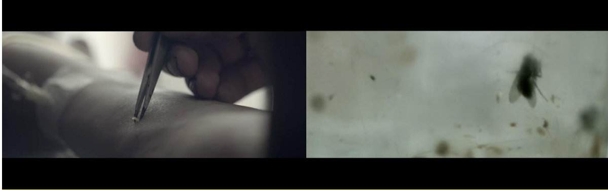
Figure 3. Close-ups highlighting Beto's physicality.