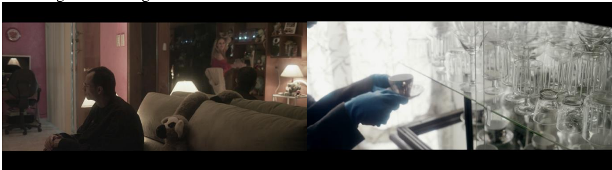
Figure 1. Cold and neutral tones juxtaposed with Luly's red walls and clothes.

The film's detached style captures Beto's solitude as an individual who has no control over his non-normative body. Ultimately Halley stages the diminished agency of a working-class man in a dehumanised capitalist metropolis. With this narrative conflict and cinematic style in mind, this article is prompted by questions of film categorization, transnational reception, and subversion against bio-power. First, I explore how the aesthetic intersections in Halley relate to