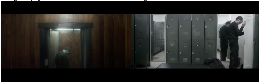
Figure 5. Geometric compositions surrounding Beto's body.

the entire film. Such colours belong in spaces like the morgue or a hospital, but they appear everywhere in the film to suit Beto's point of view, as he suffers from cataracts in his eyes. With this diegetic justification, the colour palette in the film turns every urban space into a potential clinic. The cinematography makes the disparity between Beto's body and the medicalization of biological matter apparent, yet the film removes doctors from the plot completely. They represent structures of knowledge about the body that do not serve to explain Beto's state. The categorizations of the medical system cannot control Beto's materiality, which escapes the logic of the clinic. The mortuary worker, however, naturalises his situation, guided by his own experience and not by theorization of death. With his appreciation for the decomposing corpses, the mortician represents the prevalence of organic matter, a subversive recognition of bare life, of the physicality of the bodies over their conceptualization. In Halley , despite signifying the loss of rights, physical embodiment overrides biological classifications such as life or death.