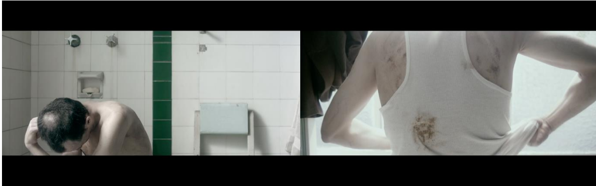
Figure 2. The materiality of Beto's body in decomposition.

audiences, but also for the commercialization of the films: it blurs the lines between small niche markets and popular culture. This phenomenon is not unique to Sitges. In fact, genres have traditionally been deployed to appeal to the audience and to support the circulation of films in the industry, even in the case of stylistic hybridization and re-articulations.